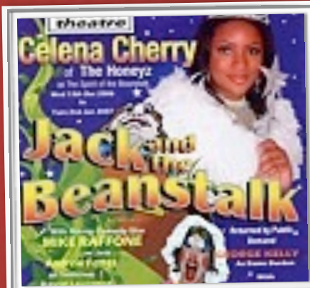
JACK AND THE BEANSTALK